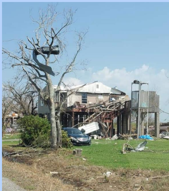
Farm damaged during Hurricane Ida, Louisiana, August 2021

Contributions to help us assist more sisters may be made at thetaphialpha.org/donate – thanks!